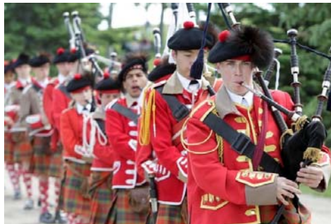
78th Fraser Youth Squad Parades at Heritage Park's Canada Day Celebration

Pictures of the event were posted in the Calgary Herald, the Calgary SUN, and most local online newspapers as well